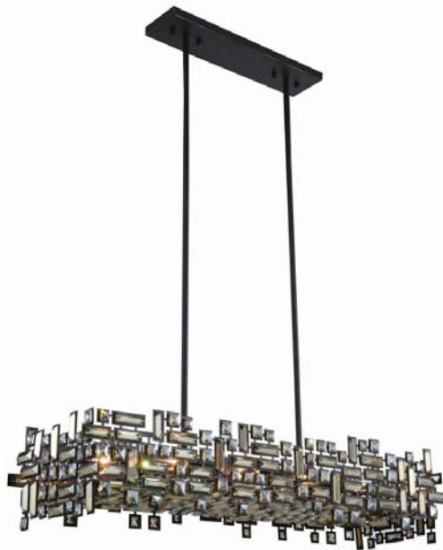
Dark Bronze Item No: V2100G44DB